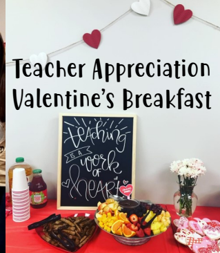
Teacher Appreciation Valentine's Breakfast