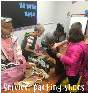
Service: packing shoes

Chick-Fil-A Spirit Day: Eat at Chick-Fil-A in Milledgeville anytime on March 17th and mention Happy Hollow Christian Academy to help raise funds!